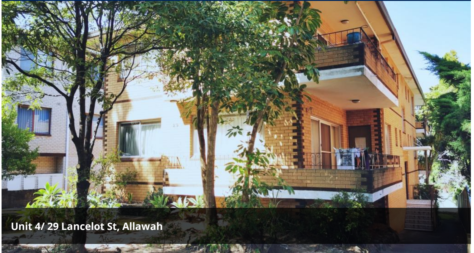
Unit 4/ 29 Lancelot St, Allawah