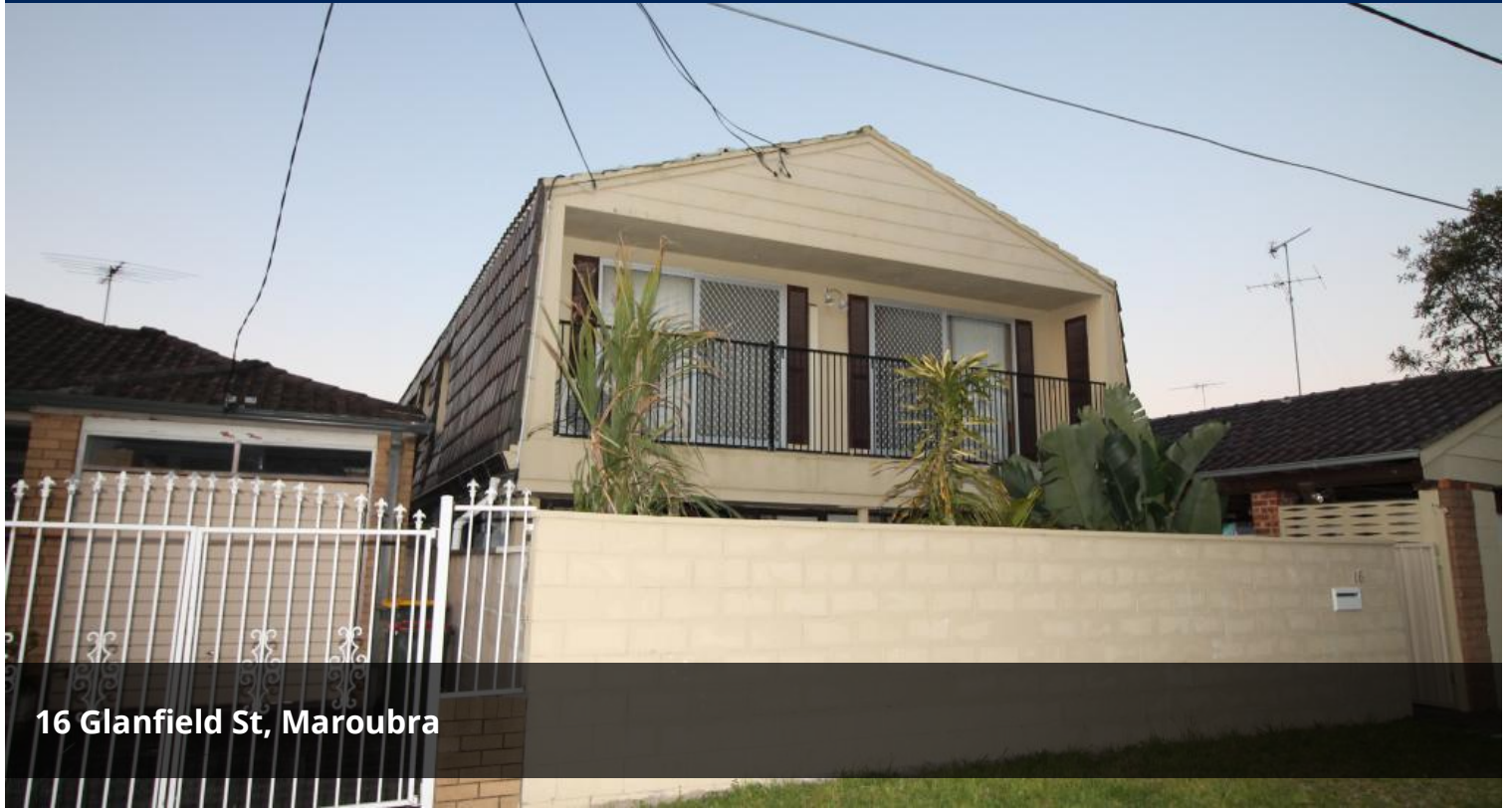
16 Glanfield St, Maroubra