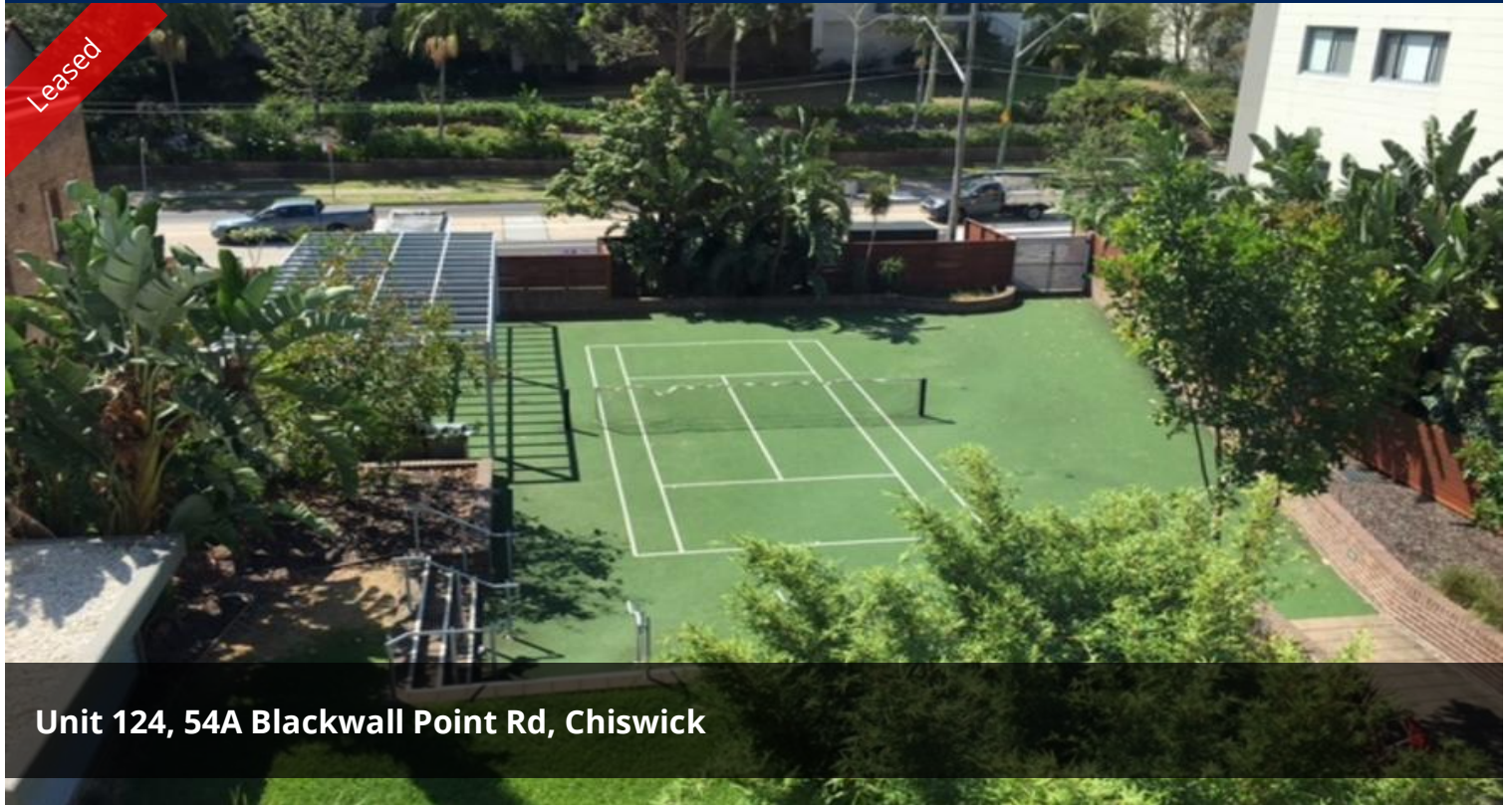
Unit 124, 54A Blackwall Point Rd, Chiswick