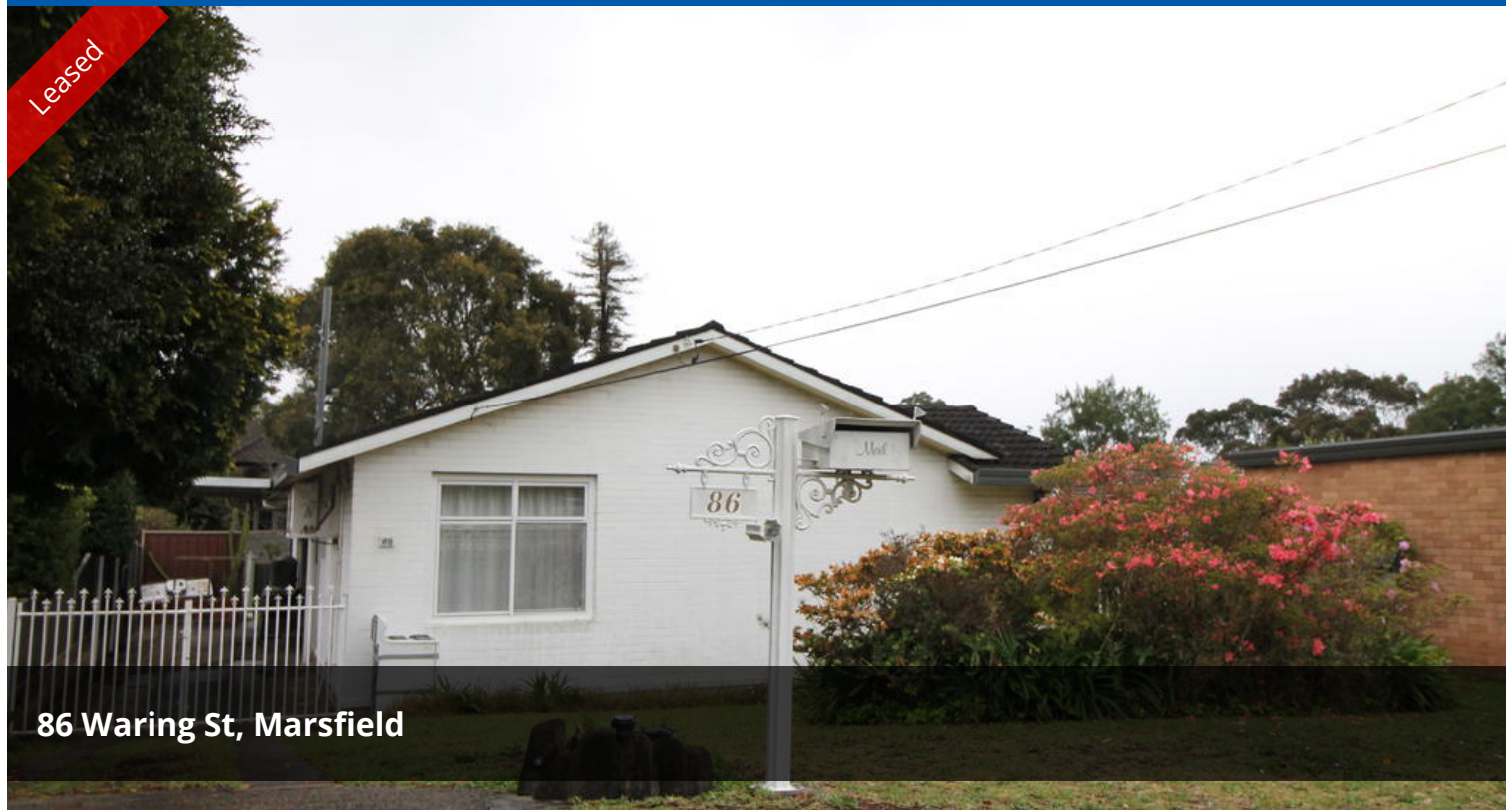
86 Waring St, Marsfield