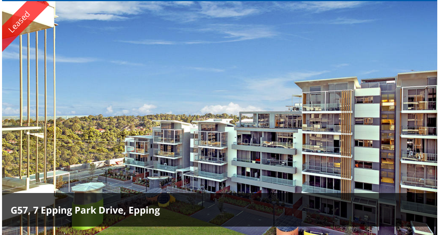
G57, 7 Epping Park Drive, Epping