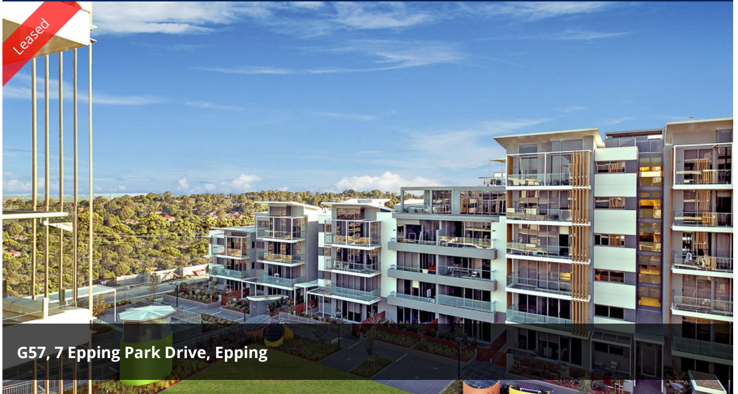
G57, 7 Epping Park Drive, Epping