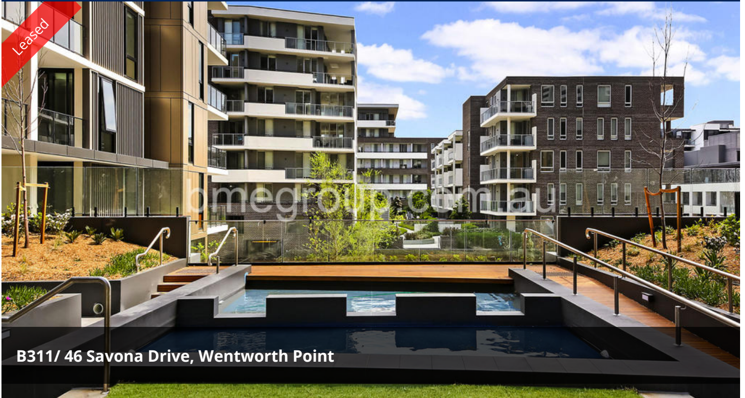
B311/ 46 Savona Drive, Wentworth Point