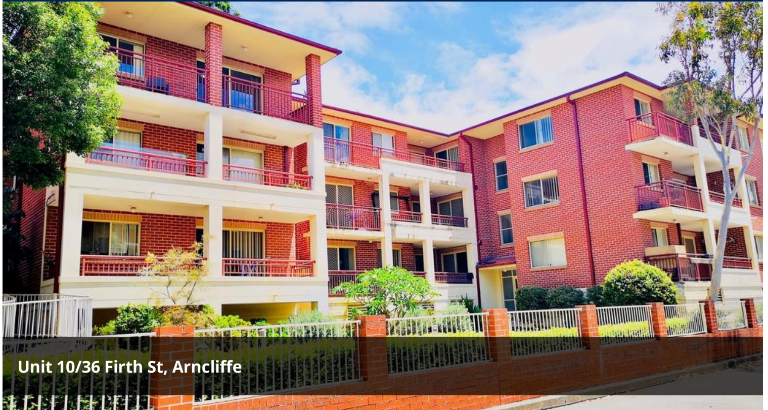
Unit 10/36 Firth St, Arncliffe